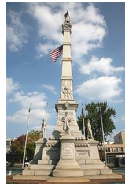
Soldier's and Sailor's Memorial, Easton, Pa.

We invite you contact us by email at easton.pa.rotary@gmail.com to schedule a visit to attend a meeting and learn more about how Rotary changes lives within our community and our world.